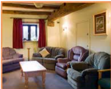
The Quiet Lounge