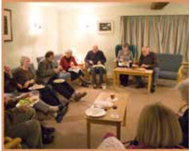
The Cider Press Lounge